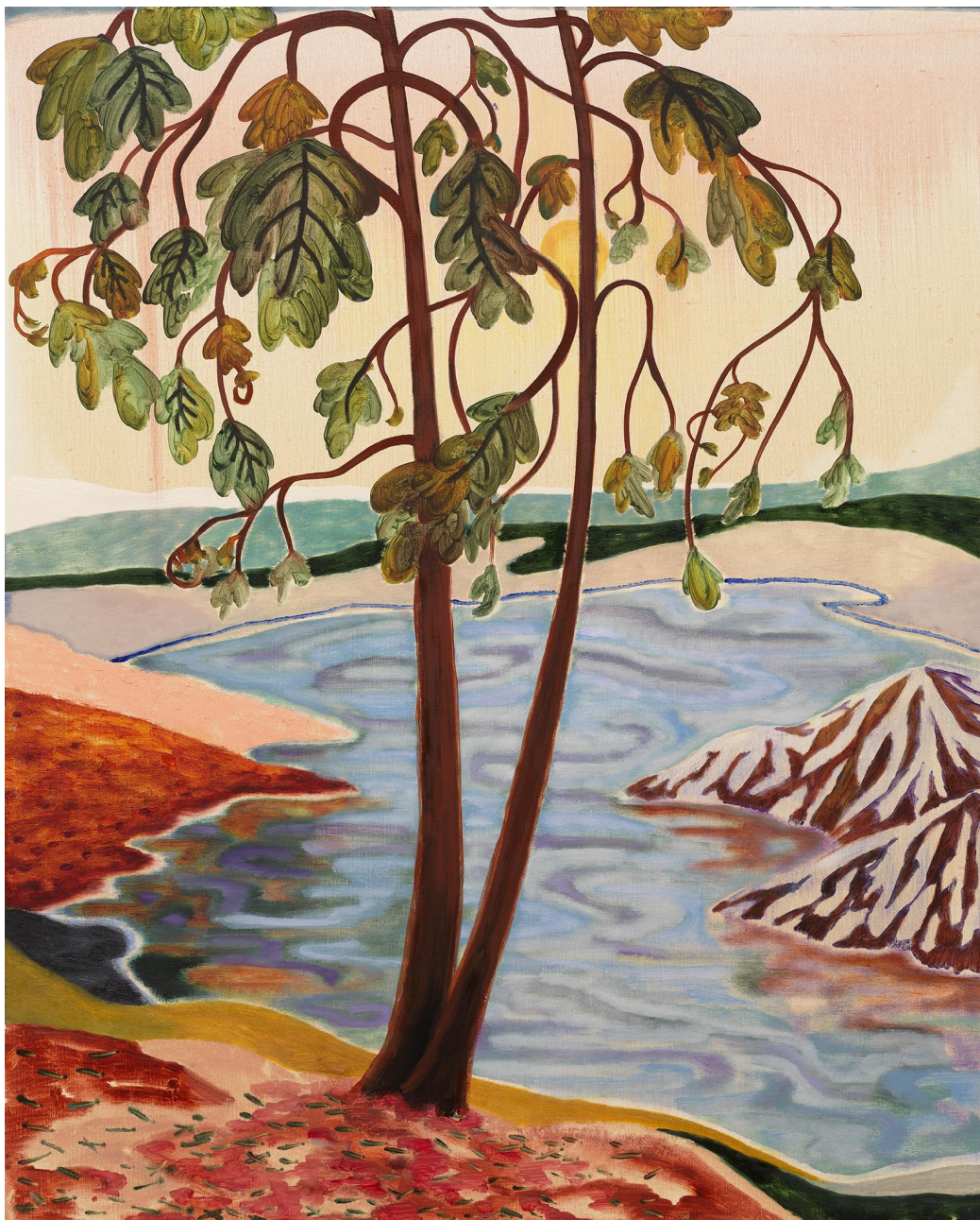
Freya Douglas-Morris I go down to the shore in the morning, 2022 oil on linen 39 3/8 x 31 1/2 in. (100 x 80 cm.)