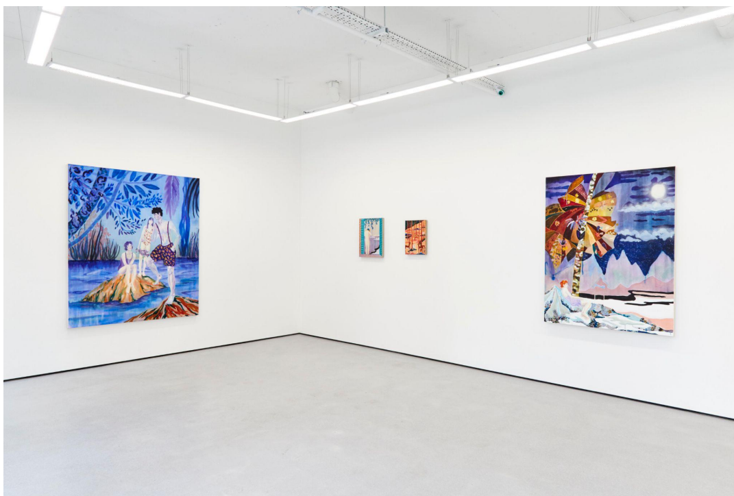
Installation view of Freya Douglas-Morris: The Sun Long Night (March 15-April 27, 2019) at Lychee One Gallery, London.