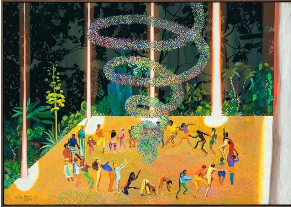
Hulda Guzmán Vybrant , 2021

acrylic gouache and watercolor ink on wood panel 33 x 46 ½ in. (83.8 x 118.1 cm.)