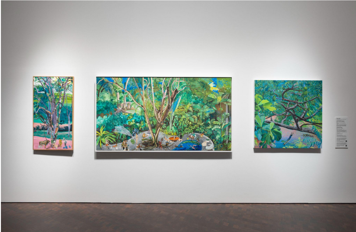
Installation view of Who tells a tale adds a tail: Latin America and contemporary art (July 31, 2022-March 5, 2023) at the Denver Art Museum, Denver, CO.