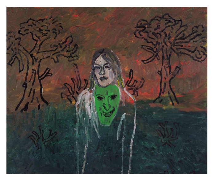
Danny Fox The Sweet and Burning Hills, 2020 acrylic on canvas 60 x 72 in. (152.4 x 182.9 cm.)

Included in Danny Fox: The Sweet and Burning Hills (January 12-February 26, 2021) at Alexander Berggruen, NY. Private collection.