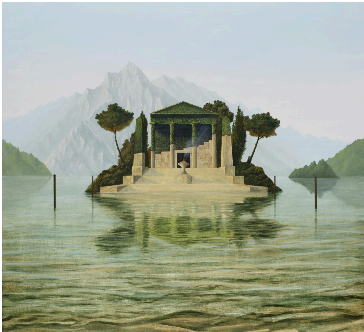
Sholto Blissett Garden of Hubris XVIII , 2021 oil on canvas on board 39 3/8 x 43 1/4 in. (100 x 110 cm.)

Included in Sholto Blissett, Emma Fineman, Madeline Peckenpaugh (December 2, 2021-January 13, 2022) at Alexander Berggruen, NY.