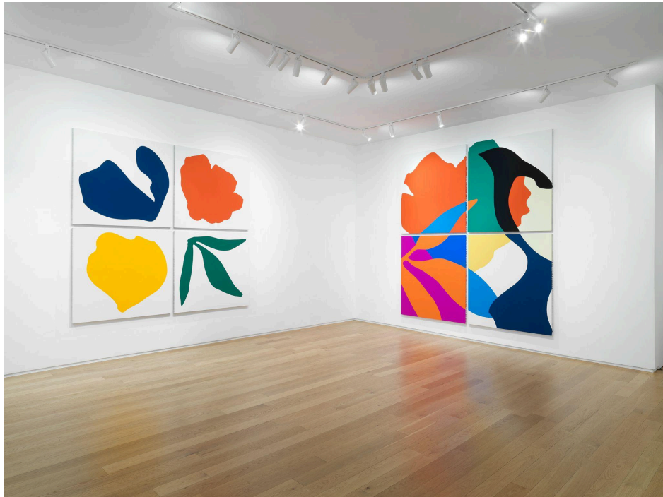
Installation view of Paul Kremer / Sets (September 6-October 11, 2023) at Alexander Berggruen, New York, NY.