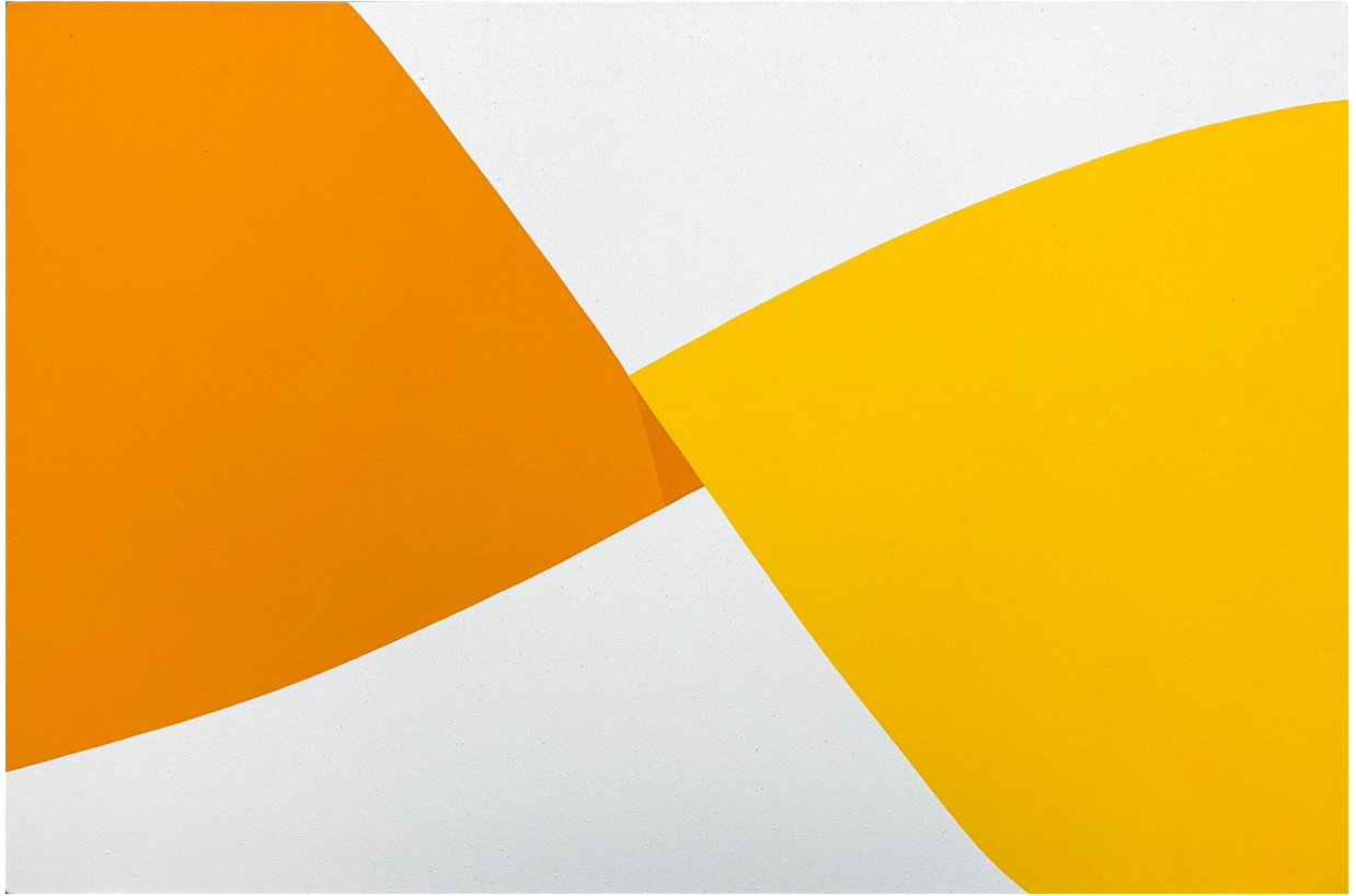
Paul Kremer Twist 02, 2020 acrylic on canvas 40 x 60 in. (101.6 x 152.4 cm.) Private collection, Bermuda.