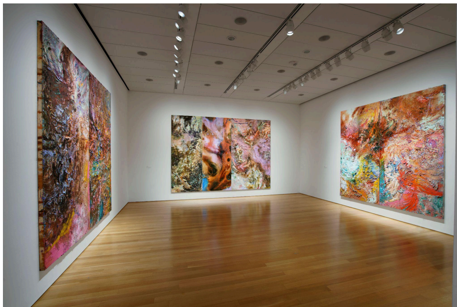
Installation view of Gabriel Mills: Aunechei (August 9-December 8, 2024) at Nerman Museum of Contemporary Art, Overland Park, KS.