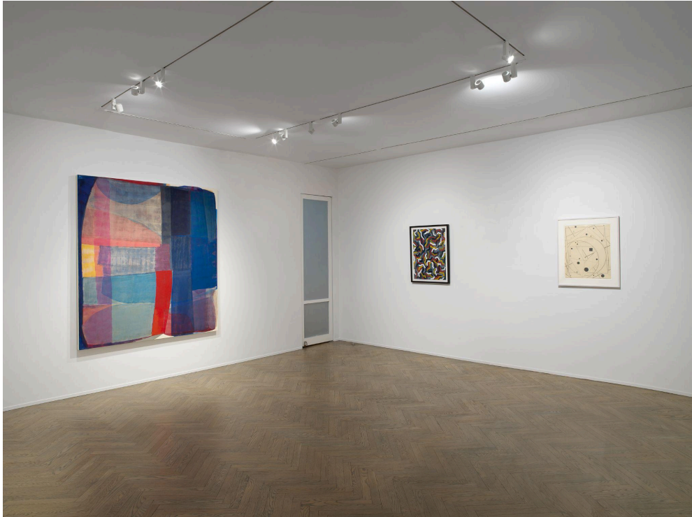
Installation view of Anna Kunz's 2021 The Blue Magnitude included in Shapes (April 21-May 27, 2021) at Alexander Berggruen, NY.