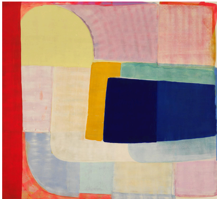
Anna Kunz Volume and Fracture , 2021 acrylic on canvas 60 x 66 in. (152.4 x 167.6 cm.) Included in Shapes (April 21-May 27, 2021) at Alexander Berggruen, NY. Private collection.