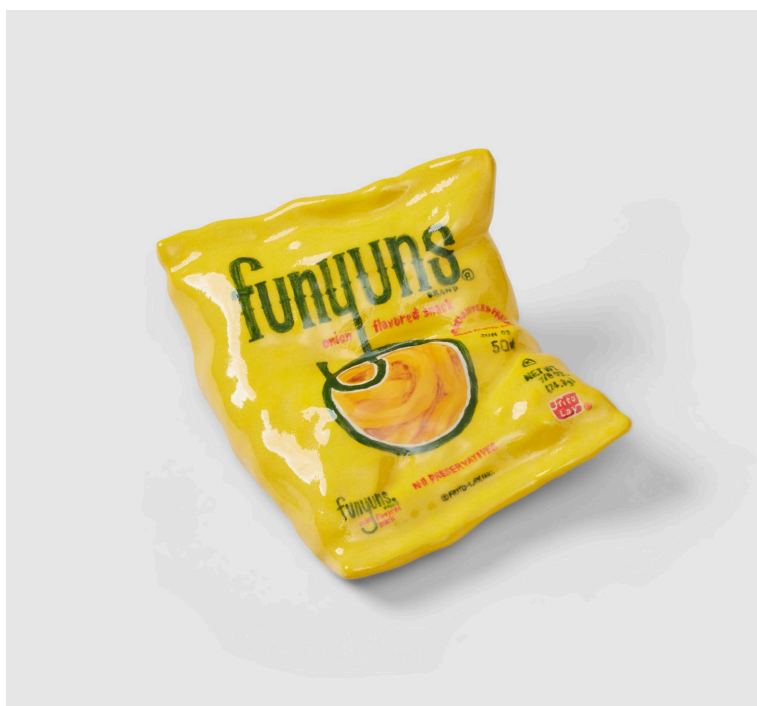
Stephanie H. Shih Funyuns Onion Flavored Snack , 2024 ceramic 3 x 5 1/2 x 7 in. (7.6 x 14 x 17.8 cm.)

Included in Alexander Berggruen's presentation at the Dallas Art Fair (April 5-7, 2024).