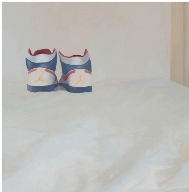
Gabriel Mills SAMPLE:101308 , 2021 oil on wood panel